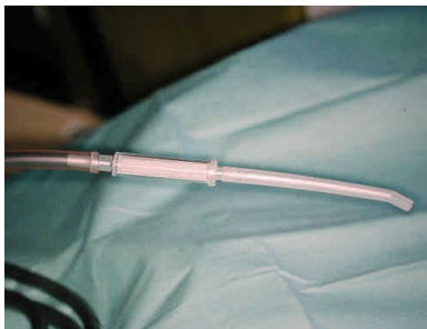
Single Use Bone Trap for collecting patient's bone